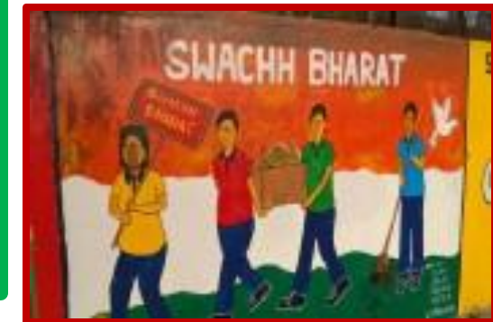
Swachh Bharat Abhiyan