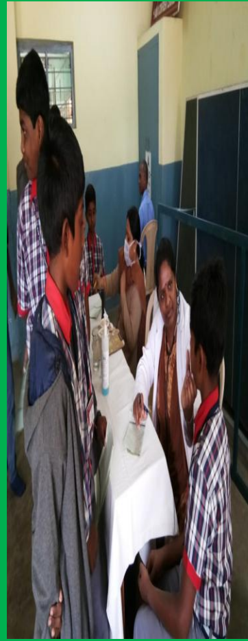
Health check up