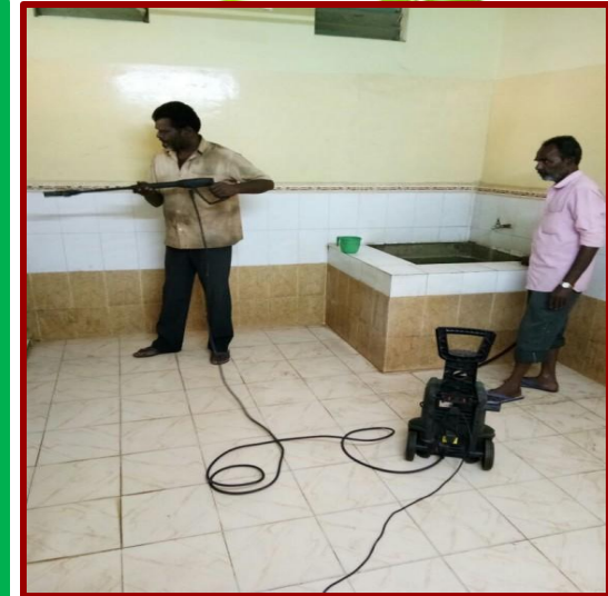
Acid Wash of toilets