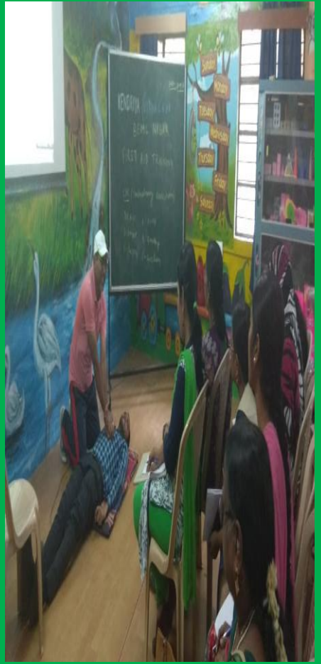
First Aid training